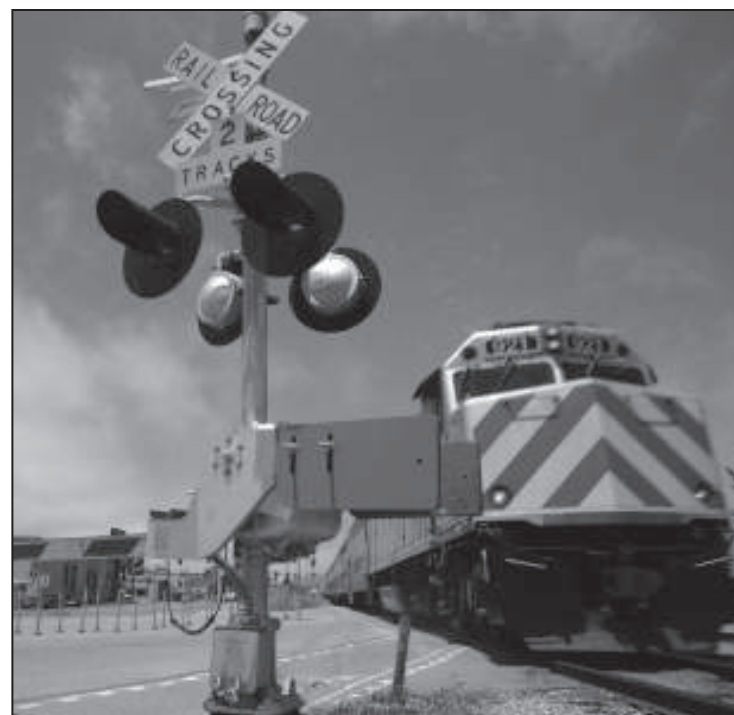
A long-awaited project to build a train overpass in San Bruno at the convergence of San Bruno and San Mateo avenues could be delayed for two to five years.

Three people died and another was seriously injured in two separate accidents on the tracks in the